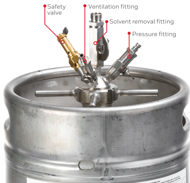
Dispensing head for containers with integrated dip tube